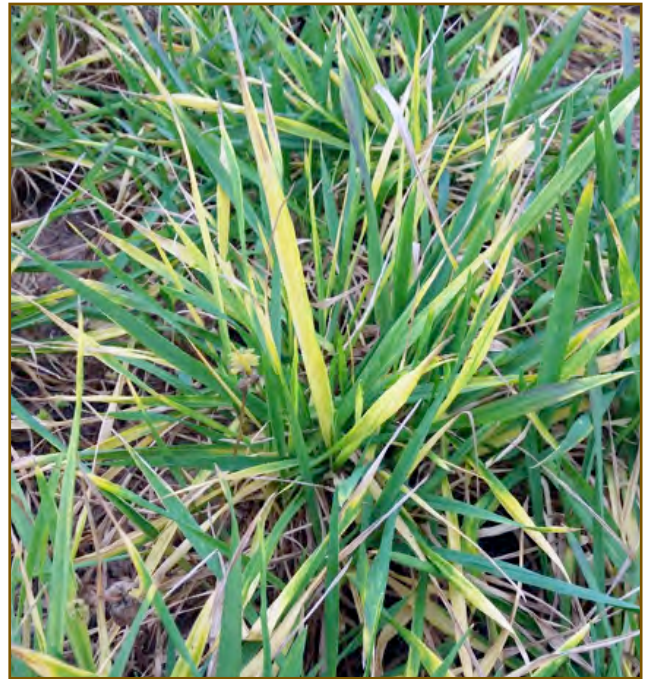
Figure 4. Glyphosate injury

Interveinal chlorosis may also be caused by damage from group B herbicides, which include the sulfonylureas (SUs), sulfonamides, imidazolinones (IMIs), and triazo-lopymidine. Refer to your spray records to check the rate and timing of herbicide applications made in the field. Also, observe if the yellowing in the field occurs in streaks that could be attributed to spray patterns. Herbicide damaged wheat may recover depending upon the severity. Tank contamination by other herbicides such as Roundup (glyphosate) can cause chlorosis of the entire plant, often accompanied by necrotic tips and leaf death (Fig. 4).