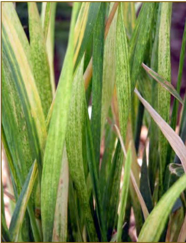
Figure 8. Wheat Streak Mosaic Virus

tissue (saprophytic fungi) and are often mistaken for diseases that might require control. If you suspect any of these diseases may be affecting your wheat, Texas A&M AgriLife pathologists can help you diagnose and identify them ( http://amarillo.tamu.edu/amarillo-center-programs/extension-plant-pathology/ ).