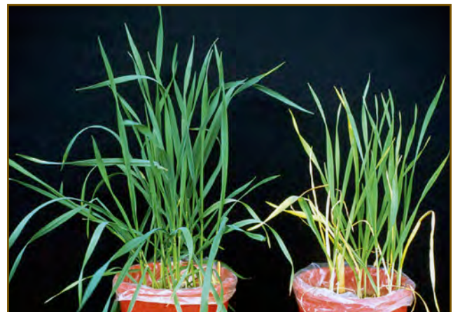
Figure 1. Healthy wheat (left) and nitrogen deficiency symptom in wheat (right)

in the older leaves first. With N deficiency, yellowing starts from the tip of the lower (older) leaves progressing to the base of the leaf without interveinal chlorosis (Fig. 1). Nitrogen deficiency often occurs in water-logged conditions. Although it is rarely found in Texas, molybdenum (Mo) and manganese (Mn) deficiency symptoms also show chlorosis in older leaves. Nitrogen deficiency is a common nutrient deficiency symptom in the Rolling Plains, High Plains, and in west Texas, especially in wheat planted after cotton.