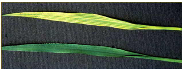
Figure 3. Iron deficiency symptom in wheat

Iron (Fe) is also an immobile nutrient; however, it can be distinguished from S deficiency symptom by the unique pattern of chlorosis. This shows up as green and yellow striping between the veins (interveinal chlorosis) (Fig. 3). Iron deficiency is most common on highly alkaline soils (pH 7.5-8.2), recently limed soil, or soil high in P, Cu, Mn, and Zn.