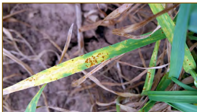
Figure 7. Rust infestation in wheat

There are three viral pathogens that commonly infect wheat in Texas' Rolling and High Plains: Wheat Streak Mosaic Virus (WSMV), Triticum Mosaic Virus (TriMV), and High Plains Virus (HPV), which is more properly referred to as Wheat Mosaic Virus (WMoV). Light green to yellow streaking and mottling appear on the leaf in the spring (Fig. 7). Often, early symptoms are confused for N deficiency and/or water stress. Many producers attempt to rectify the symptoms with fertilizer and irrigation, but the infection prevents the plant from using these. A less common viral disease is Wheat Soilborne Mosaic Virus, which regularly occurs in Oklahoma and may occur in the Rolling Plains. Symptoms are similar to other mosaic viruses and generally appear in early spring as wheat breaks dormancy. It also can show up in wetter, low-yielding areas of a field. In central and South Texas, rust often overwinters and during mild winter, rust pressure can lead to yellow spotting or yellowing leaves.