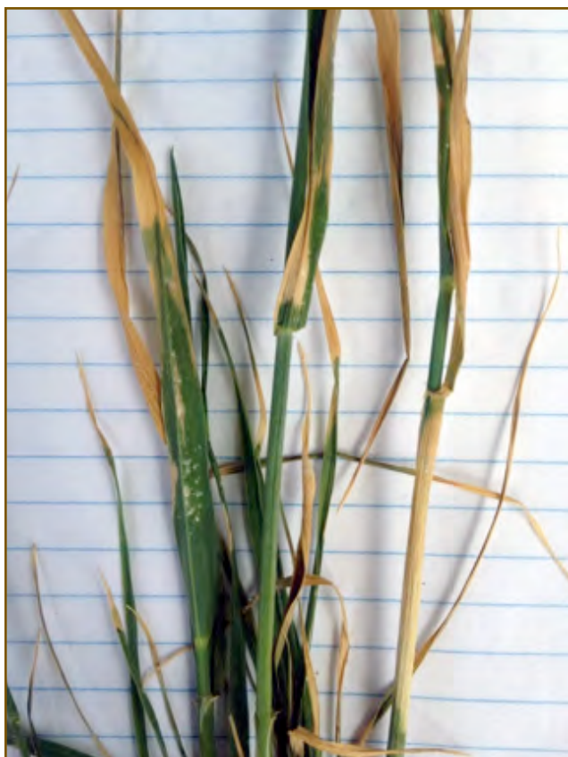
Figure 5. Fertilizer burn in wheat