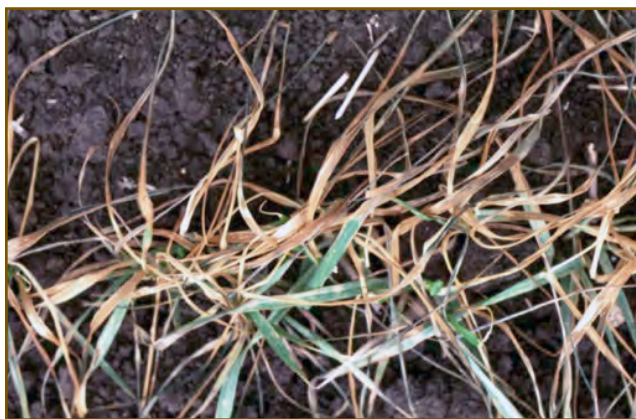
Figure 6. Freeze injury in wheat

A sudden drop in temperature can cause leaf burn. This yellowing may be more concentrated in the low areas of a field where cold settles when there is no air movement (Fig. 6). Freeze injury during the tillering stage has little effect on final grain yield. Wheat can recover from freeze injury by developing new leaves from the growing point assuming it was not damaged during tillering or jointing. However,