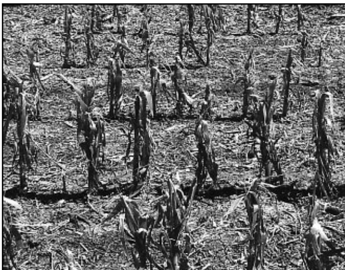
Ragged, hail-damaged corn plants exhibit various degrees and types of damage. Considerable leaf loss may be sustained with minimal loss of yield potential if corn is very young or is almost mature. Shredded leaves become wrapped around the remaining plant and initially restrict the emergence of new growth.