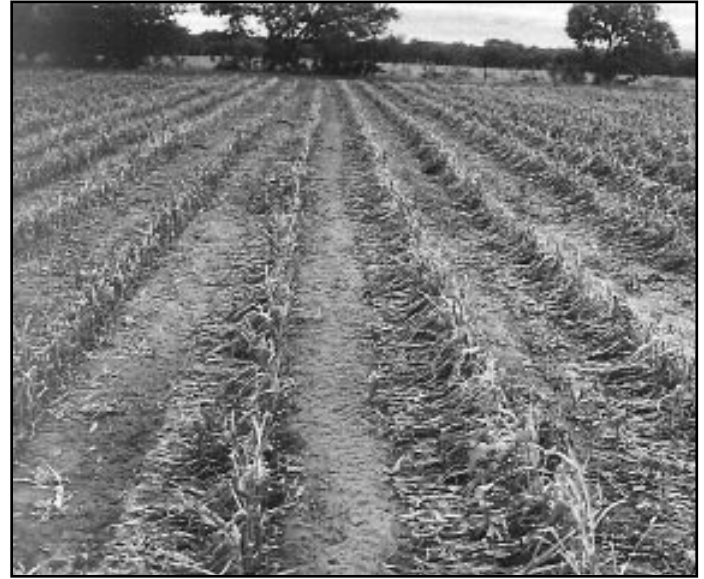
Hail damage to sorghum creates almost prostrate plants. Water loss will be extensive from the multiple breaks and bruises. Good soil moisture and sunny weather are important to the recovery of damaged stands.

Salvaging Older Hail- or Frost-Damaged Corn. If immature or wet, mature corn or sorghum is freeze-killed or severely damaged by hail and there is a use for silage, a silage chopper can be used to harvest the remaining erect plants. The chop can be placed in conventional silos, or it can be blown into commercial plastic silage-bags which are positioned on a smooth surface. The quality and nutritional value of the silage will be best when ears are present and grain has formed. Baseball-sized hail will breakout plant tops, bruise ears, and lodge plants. Most leaning plants can be recovered with a silage chopper.