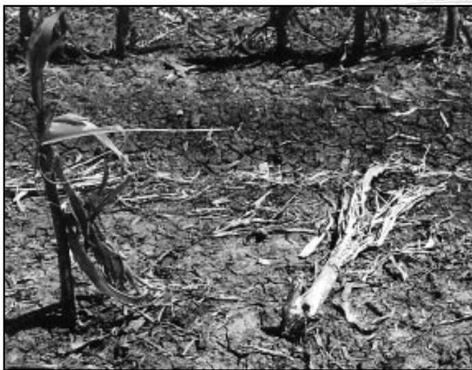
Plants broken-over are considered as lost. When making stand counts, exclude broken plants and those which are known to have bruised or damaged growing points. If field counts do not exceed 13,000 plants per acre, skips and population gaps cannot be offset through flexing in ear size.

Determine Plant Density. The density of surviving plants should be determined as a basis for assessing the need for replanting. Corn plants are not very efficient when growing at temperatures above 90°F. Late-planted corn will produce lower