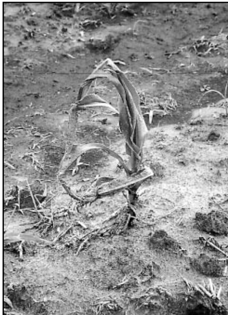
New growth may have trouble emerging through old damaged tissue (trash). Buggy-whipping may occur temporarily, but 85 to 90 percent of these plants break through and resume normal growth.

the growth stage and type of damage is such that a large percentage of plants will have difficulty growing through the old damage. In this situation some producers have gone over the field with a forage chopper set on a higher setting, to remove the buggywhips and restrictive trash materials.