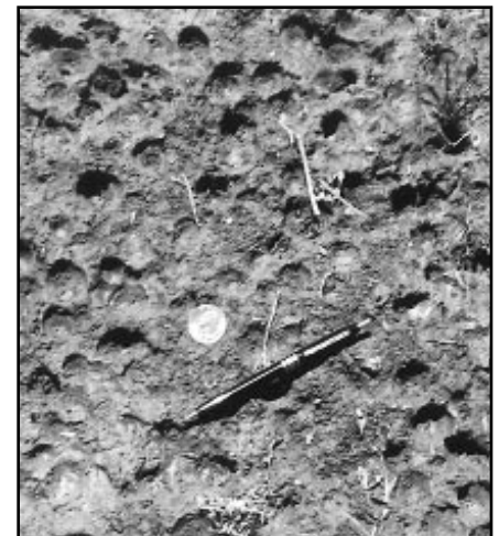
If the field is wet, quarter-sized hail can compact soil as well as shredding corn stands. It may be warranted to cultivate compacted fields to breakup compaction and to eliminate any surging weed competition.

damage sustained. Fields receiving heavy rain are often crusted or compacted from the hail. If you